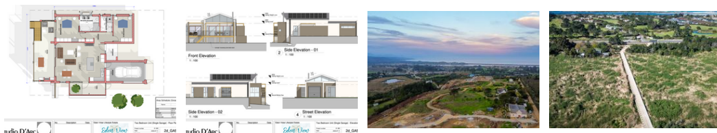
Web Ref RLS970973