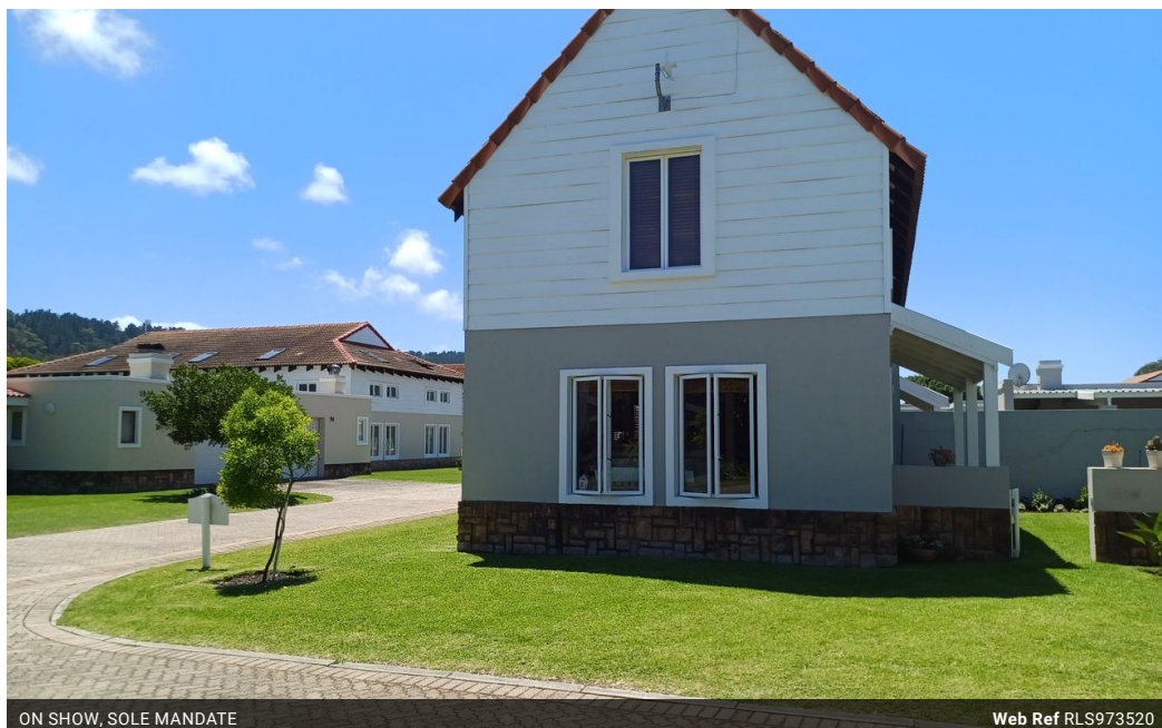
ON SHOW, SOLE MANDATE