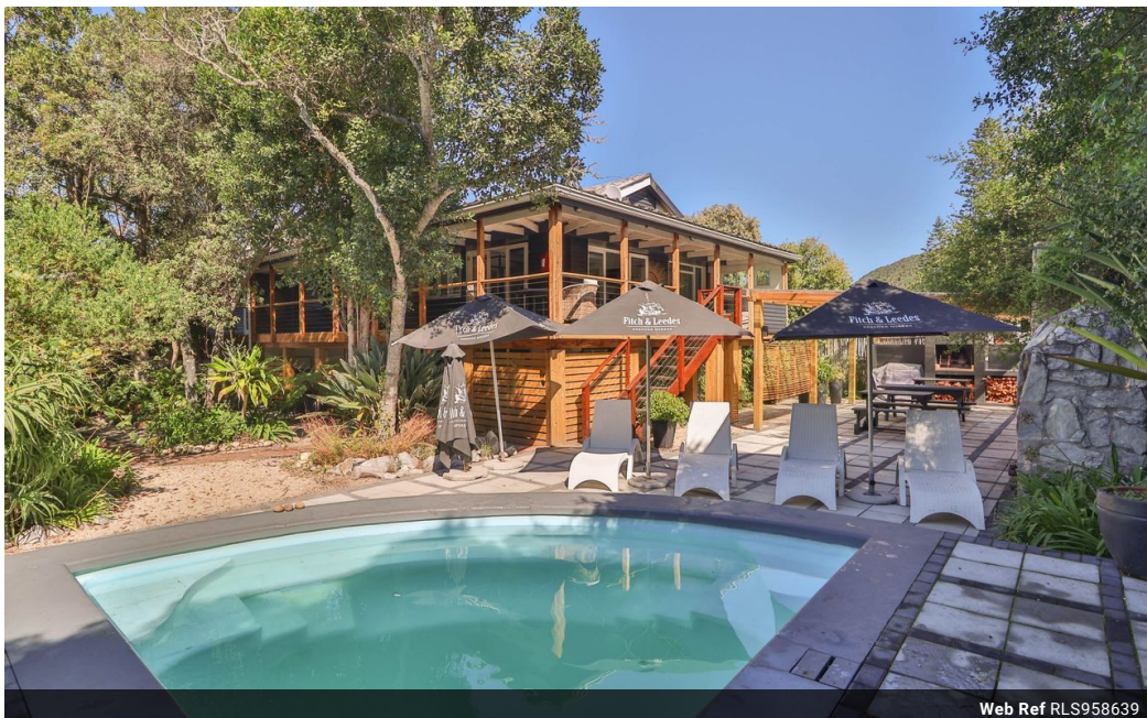
Web Ref RLS958639

Sun Centre CNR Main & Church Street Plettenberg Bay